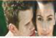
Since when does Kim (with Kris) cover up her abs while in a bling?

K im Kardashian has a lot going on. She's newly married to Kris Humphries and still figuring out how to be a Mrs., she's adjusting to a new town after moving to NYC, and now, there may be another big change. "Kim said she's late," a pal tells OK! . "She was supposed to get her period and didn't." It's a welcome development for the star. "Kim always thought she'd have several kids by age 30, so in her mind she's behind schedule," says an insider. In fact, says the source, Kim is doing tons of stuff that makes those around her wonder if she already has a secret. "Kim's been going through all the K names," says the insider. "She even has a baby-name book and looks up the meaning of each one." But that's not all. OK! also noticed a few of the other reasons why everyone thinks Kim has baby on the way.